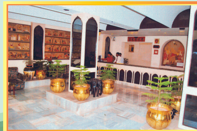
Hotel Swosti Pvt. Ltd. Bhubaneswar