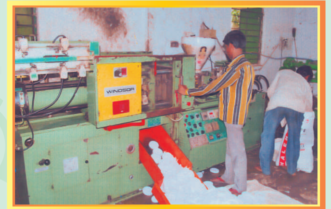
Techno Plast, Bhubaneswar