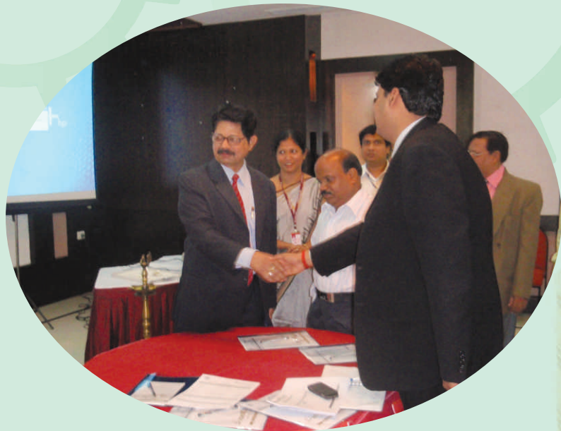
Sensitization Programme with M/s ICICI Lombard General Insurance Co. at Cuttack