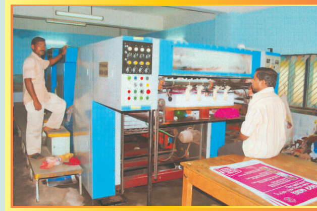
Nirvik Printer Bhubaneswar