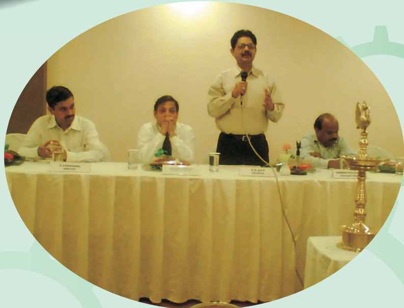
Interacting Workshop with M/s HDFC Standard Life Insurance Co. at Bhubaneswar